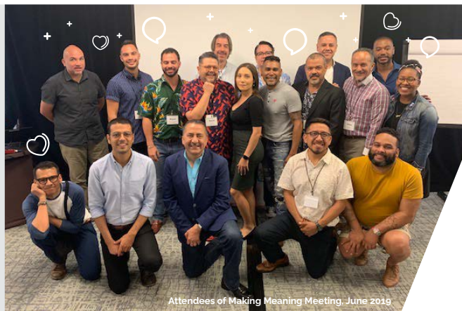
Attendees of Making Meaning Meeting, June 2019

are closely connected to the local Latinx gay and bisexual community and worked closely with ViiV Healthcare over nine months to customize the listening approach to fit the nuances of their local communities. Captains across the US and Puerto Rico met every month to discuss lessons learned and share preliminary themes from the sessions. This iterative approach was a crucial element of the listening tour because it enabled us to learn and tailor the way we listened to fit the diversity of Latinx communities.